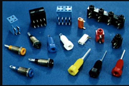
TIP AND TEST JACKS